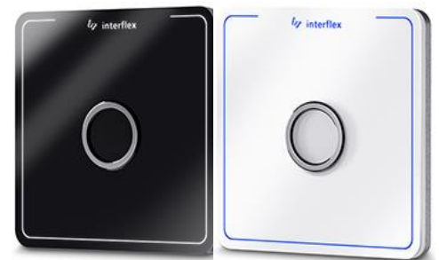
(IF-800 cover kits – to be ordered separately – accessories 75-800-015x)